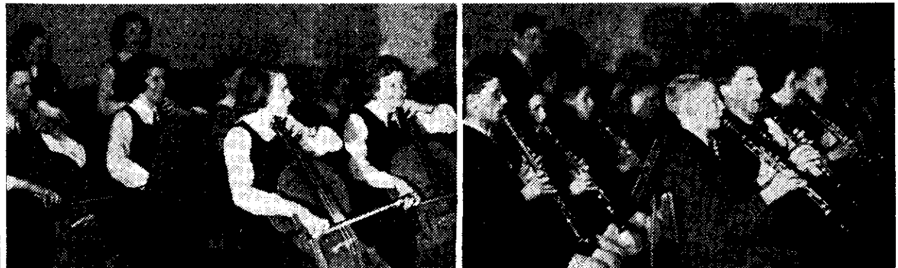
Some of the members of the orchestra of 380 players taking part in the recent music festival of the King Edward Technical College, Dunedin. Items by the orchestra and choir of 700 voices under Frank Callaway's direction were recorded by 42B and will be heard in a series of Sunday sessions