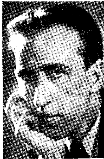
DMITRI KABALEVSKY, the Soviet Composer. An overture by him will be heard in a programme of Soviet music from 2YC at 9.01 p.m. on Saturday, September 8