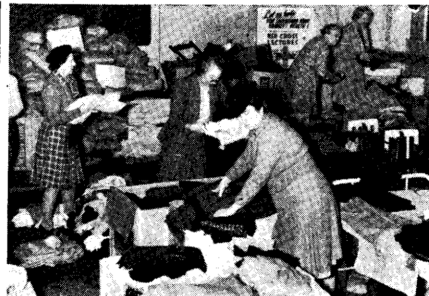
Sorting and packing clothes for Europe at a Red Cross depot