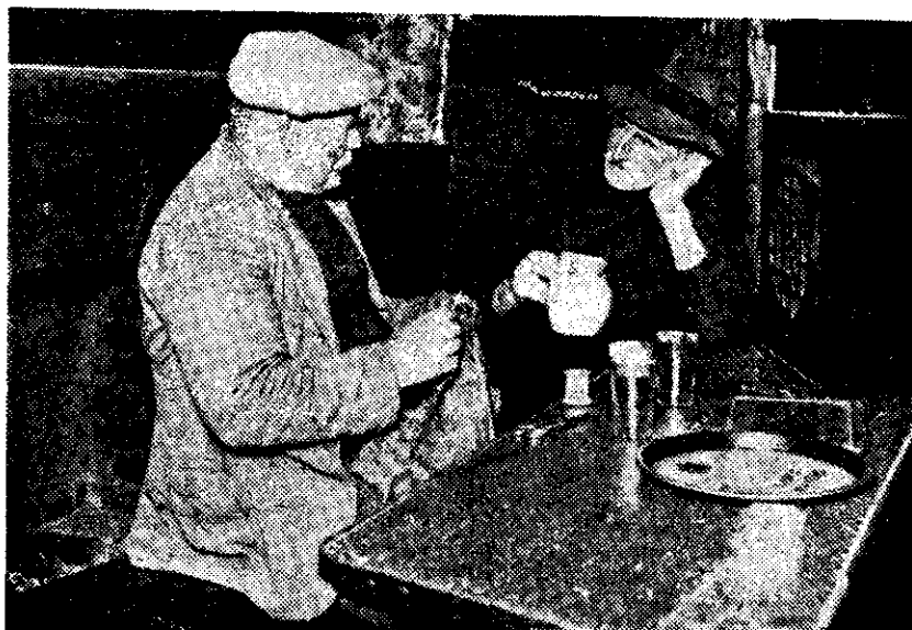
A photograph from the BBC of a typical corner of an English inn. A programme called "The English Inn" in the series "It's An Old English Custom" will be heard from 1YA at 8.22 p.m. on Tuesday, July 17