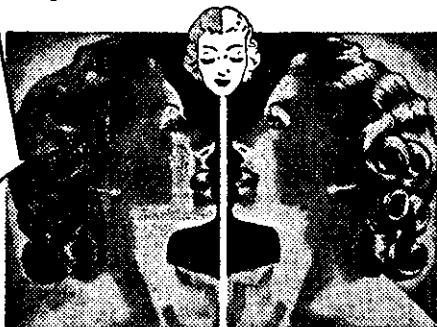
SHOWS THRILLING DIFFERENCE: LEFT: Soap-washed side—dull, lifeless. RIGHT: Colinated side. Hair like silk.

Thrill to see your hair glorified by this amazing new shampoo—proved by the most daring tests ever made on a shampoo!