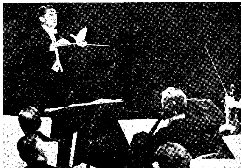
JOHN BARBIROLLI , here shown conducting the New York Philharmonic Orchestra, will be the conductor featured in 4YA's classical hour on Monday, June 18. On Thursday, June 21, from 4YA, listeners may hear Schubert's Symphony No. 4 played by the same orchestra under Barbirolli.