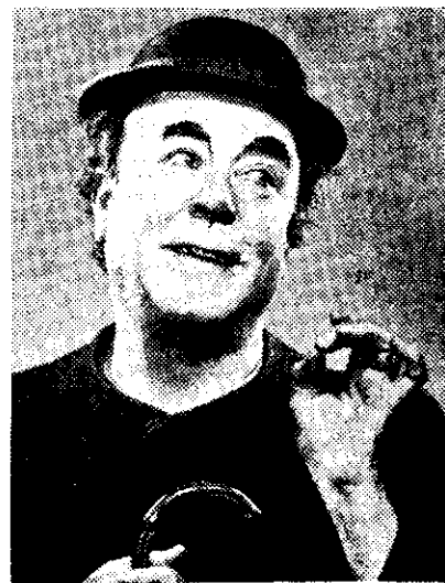
GEORGE ROBEY , the original and one and only, who is sometimes heard in the BBC series "Palace of Varieties" from the National stations