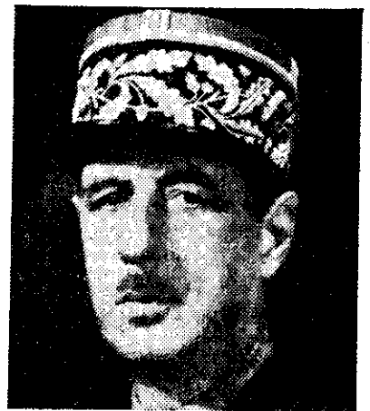
GENERAL DE GAULLE