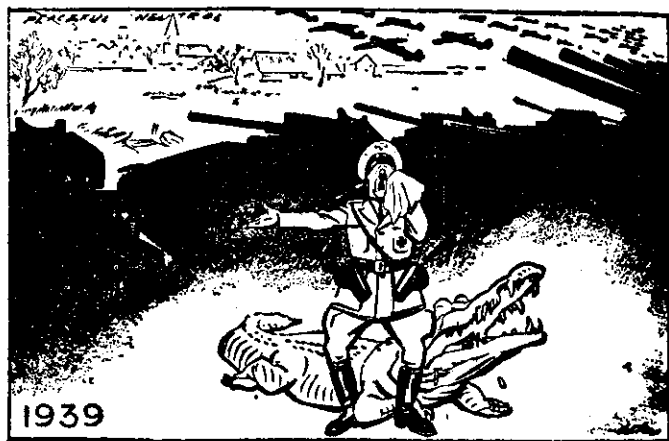
"Ooo, That Wicked Chamberlain! See What He's Going to Make Me Do Now!"