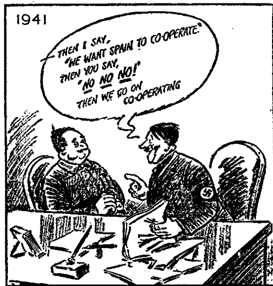
"Running Over the Script."—Panama.