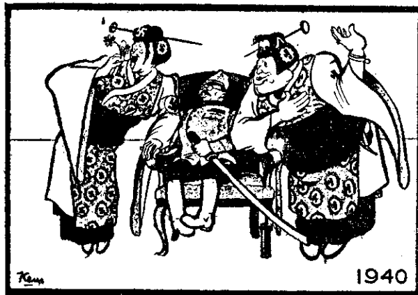
"The Wooing of Japan."—London.