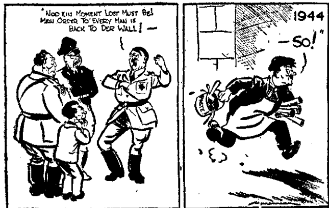
"Rehabilitation."—Minhinnick, Auckland.