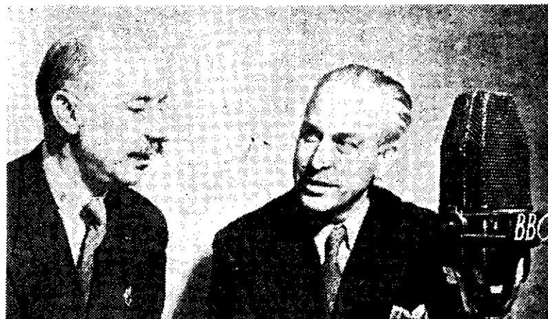
ARTHUR BLISS (right) with SIR ADRIAN BOULT, who conducts the Liverpool Philharmonic Orchestra in the new recording of Arthur Bliss' Concerto for Piano and Orchestra to be heard from 2YA on Sunday, May 6