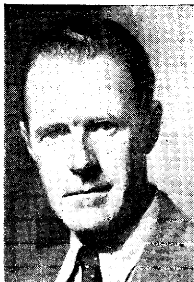
The English author L. A. G. STRONG , whose play "Dinner With a Novelist" will be heard in a BBC programme from 1YA on Tuesday, May 1