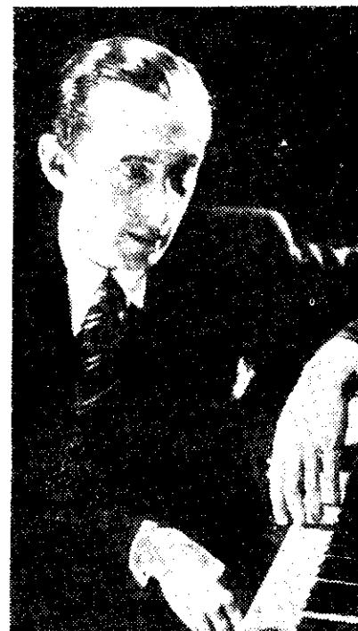
THE HANDS OF HOROWITZ. A London photographer's study of Vladimir Horowitz, the famous pianist heard often in U.S.A. programmes