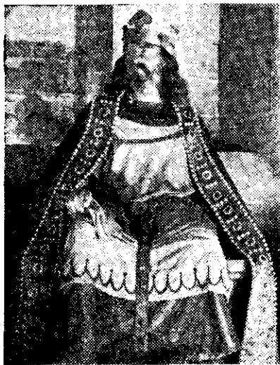
An unusual Person in the Programmes this week is KING JOHN, of whom a photograph appears above. For the explanation of how he comes to be in the programmes, see the Monday paragraph on Page 4.