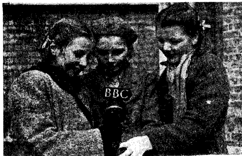
BBC photograph THREE DOVER CHILDREN at Brighton recording for the BBC overseas radio newscast. They were among the 190 children who were given a holiday after the severe shelling of Dover last September, the New Zealand Government contributing to the Lord Mayor of London's fund for the purpose.