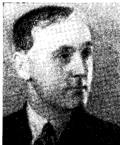
Alan Blakey photograph