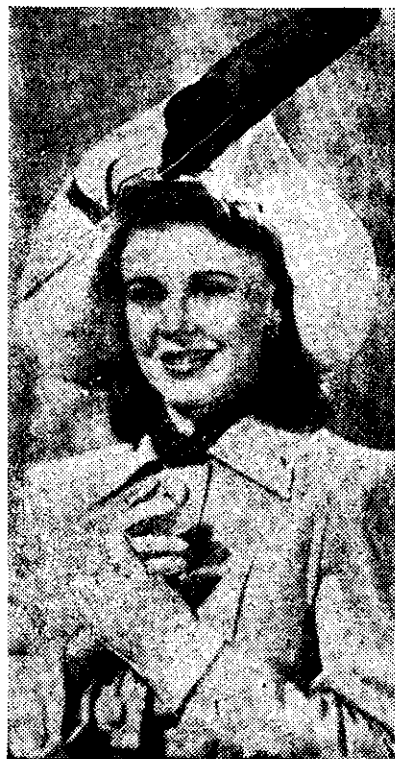
Below: GINGER ROGERS will be the star in the musical presentation of "Alice in Wonderland" from 2YA on Saturday, March 10.