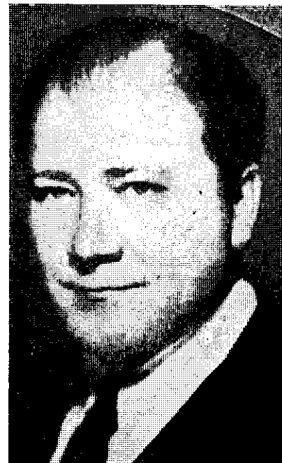
JOHN CHARLES THOMAS, the popular American baritone whose records are often heard from National and Commercial stations.