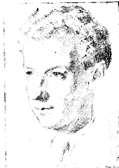
BENJAMIN BRITTEN , composer of "Seven Sonnets of Michelangelo," which will be heard from 1YA on February 14. Britten was born in England in 1913.