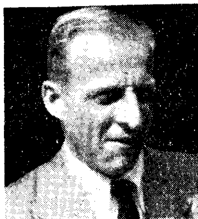
JOSEPH C. HARSCH , the well-known American journalist who visited New Zealand in 1942. He will be heard in the BBC Pacific Service on Tuesday, February 13, at 6.15 p.m., when he will give the American Commentary.