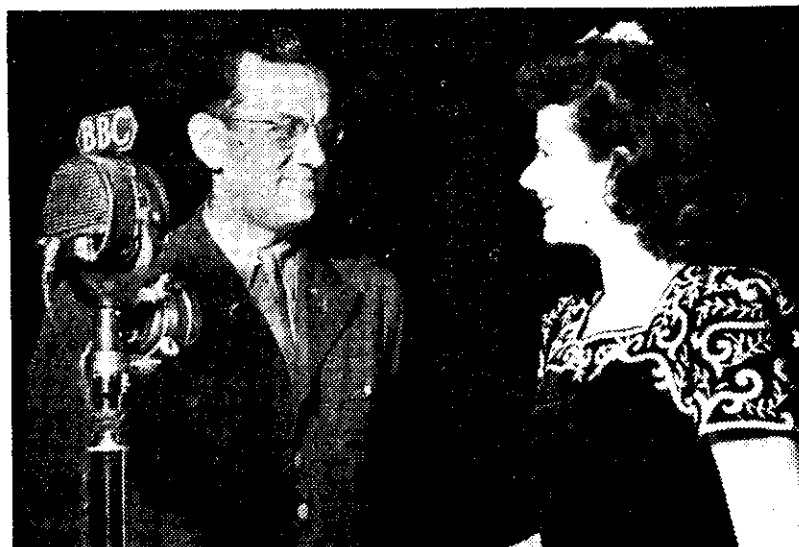
CAPTAIN GLENN MILLER, U.S.A.A.F., the celebrated band leader, with Margaret Lockwood, British film star, in a BBC programme broadcast to the forces overseas.