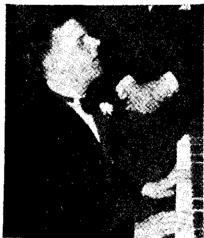
ALEC TEMPLETON, blind pianist and entertainer, will be heard in a recital from 2YH on Friday, October 13.