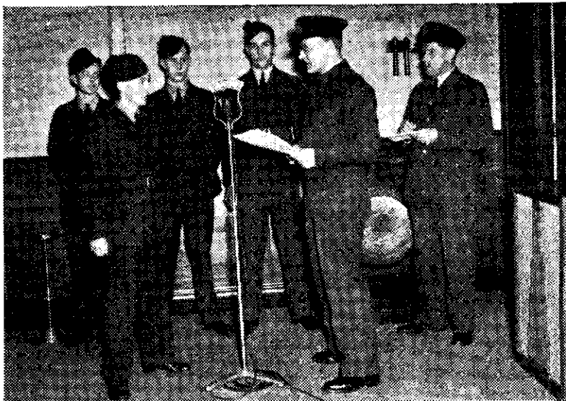
A.T.C. Cadets face the microphone in the "First Solo" quizz session

The questions, although not particularly technical, cannot by any means be described as easy, but although they