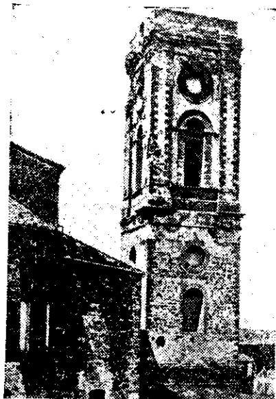
The tower of San Miniato, showing the damage done by "shellfire" in 1529.