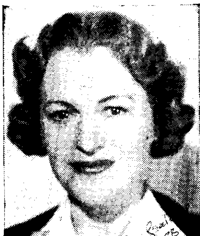
GRACIE FIELDS will be the guest artist in the Duffy's Tavern programme from 1ZB at 3.30 p.m. on Saturday, July 29.