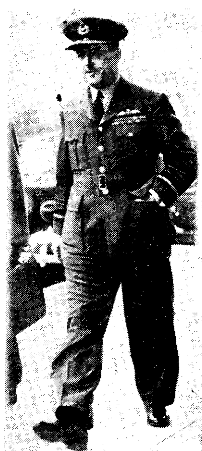
HERE WE GO! Left: Admiral Sir Bertram Ramsay, Allied Naval Commander-in-Chief. Middle: General Montgomery. Right: Air Chief-Marshal Sir Trafford Leigh Mallory, Allied Air Commander-in-Chief.