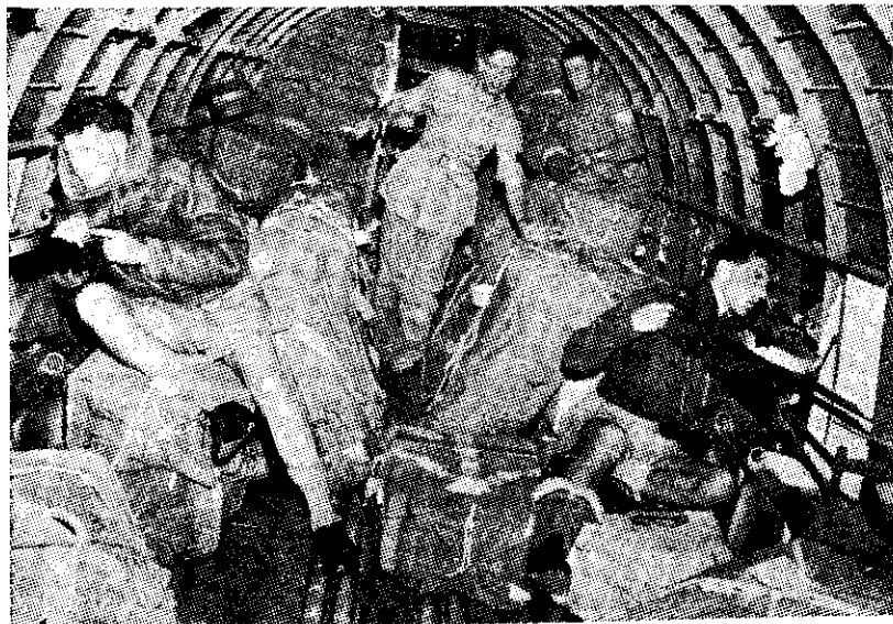
THE CREW of an American plane carrying supplies for "Wingate's mob" mans machine-guns against Japanese interceptors.

THE British Army seems to produce one such eccentric soldier-genius in every generation — Clive of India, "Chinese" Gordon, Lawrence of Arabia. Wingate is a "sword and Bible" general, a profound believer in prayer, a mystic given to Yoga, and a hard-bitten professional soldier who loves fighting for its own sake. He starts the day with prayer, uses Scripture passages for code. The sword, the Bible, and the flair for strange races are all a part of Wingate's heritage. His father served 32 years in the Indian Army, and after retiring, founded a mission for the Pathans. His deeply religious mother gave him a Puritan unbringing.