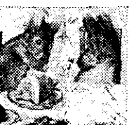
Two Bad Mice