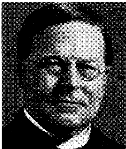
ARCHBISHOP OF CANTERBURY will give a lead to five others