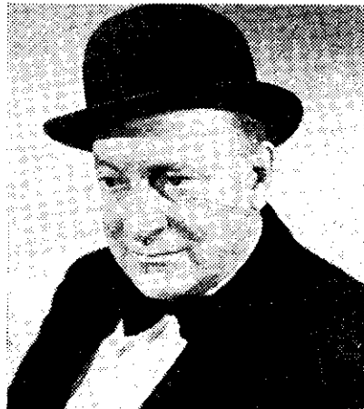
ERIC BLORE , starred in the Hollywood Radio Theatre play "Crichton Plays Cupid," from 2ZB on Thursday, March 2, at 8.5 p.m.