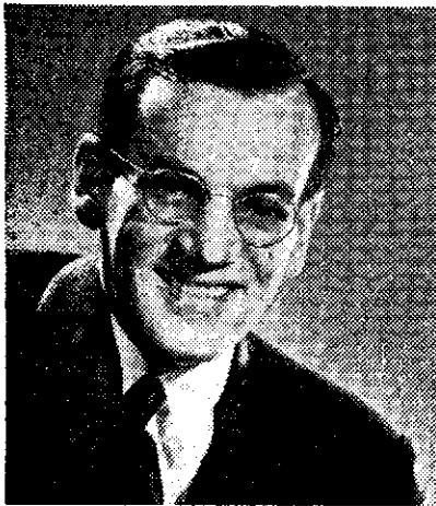
GLENN MILLER , whose famous orchestra will be heard from 12B on Tuesday, February 29, at 6.30 p.m. Miller is now a captain in the U.S. Army, training unit bands