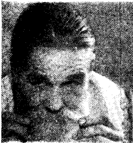
GREAT RUSSIANS , numbering 100,000,000, have spread over all European Russia. They form the great majority of the U.S.S.R.

But of the U.S.S.R.'s 193,000,000 people only 150,000,000 are actually Russian Slavs. Instead of one people, the Russians are 175 peoples at least. They speak 150 different languages and dialects, and believe in dozens of different religions. Not only does each people speak and write its ancient and native language, but the Soviets foster this cultural nationalism among all the 175 Peoples that for centuries have spoken an unwritten language without alphabet or