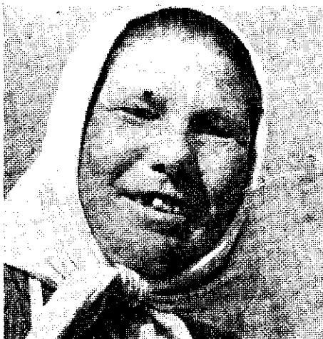
UKRAINIANS (Little Russians), numbering 38,000,000, are taller and darker than Russians, but use a similar alphabet.