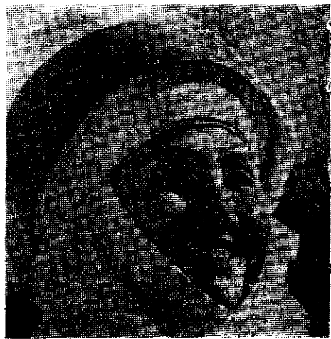
KIRGHIZ , numbering 885,000, raise fat-tailed sheep in the mountains next to China. They are descendants of the Mongol hordes.