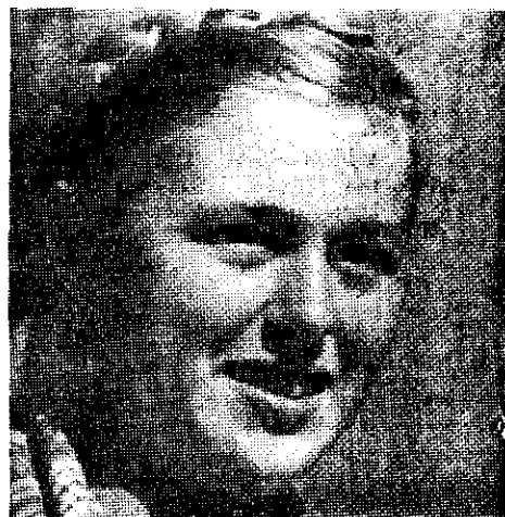
GERMANS , numbering 1,500,000, were settled in the bend of the Volga and the Ukraine. They were moved east when the war started.