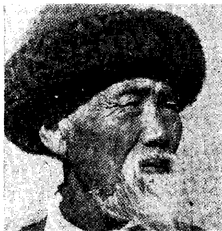
KAZAKHS , numbering 2,000,000, are, with the Uzbeks, the leaders of 9,700,000 Moslem Turco-Tartars of Central Asia.