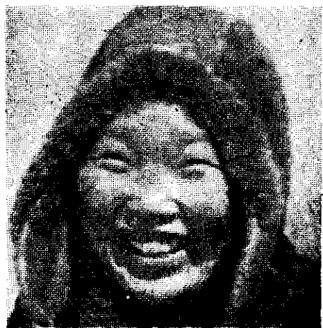
YAKUTS , numbering 300,000, people the most uninhabitable Lena River basin in northern Siberia. They are related to Turco-Tartars.