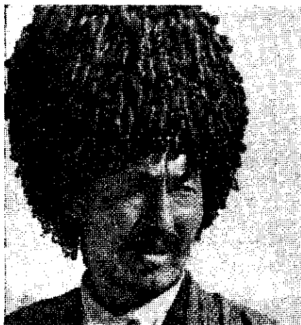
BALKARIANS , numbering 43,000, are the aristocrats of the Caucasus. They lately adopted the Cyrillic instead of the Arabic alphabet.