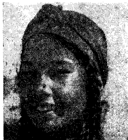
TURKMEN , numbering 800,000, live on the steppes north of Iran. There are also 20,000,000 Turco-Tartars in the U.S.S.R.