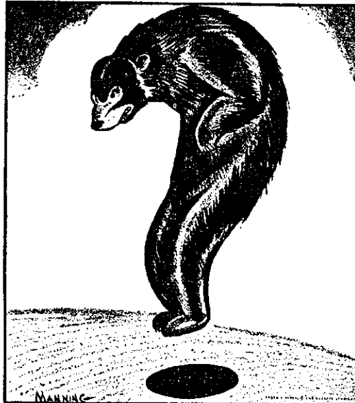
The Russian Bear—Europe's Great Question Mark

Now Rumania is in a difficult position. When the Poles ran away they ran into Rumania, which was most embarrassing, because they were running away