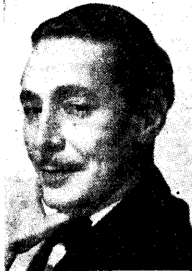
THIS is Reginald Gardiner, one of MGM's brightest comedians, who will be heard giving his celebrated Dissertation on "Trains" from 2YH on Thursday evening, December 21