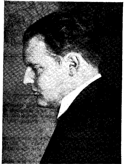
FAME at the age of 20 was the portion of Constant Lambert (above) who, at that age, composed the music of the Diaghileff ballet "The Rio Grande." The orchestral programme from 4YO on Wednesday, December 13, features "The Rio Grande" at 8.23 p.m.