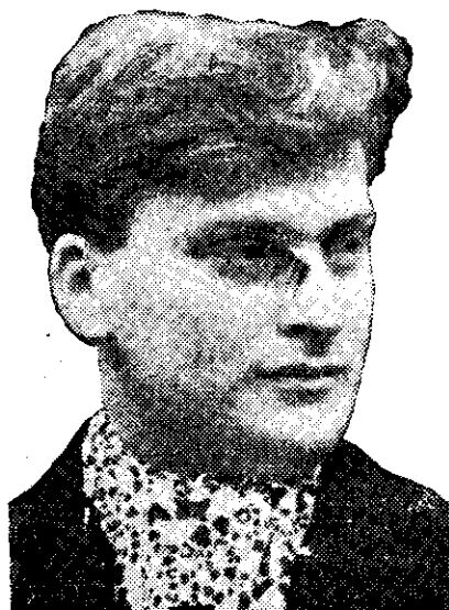
YEHUDI MENUHIN, the young violin virtuoso, who, with the Orchestra of the Concerts de Conservatoire, will present Dvorak's "Concerto in A Minor, Op. 53," from 1YA on December 10