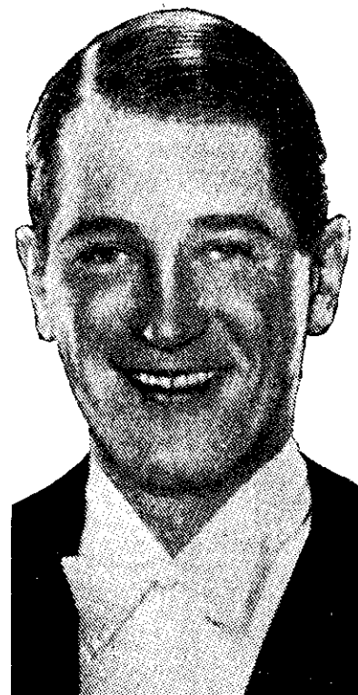
SMILING Maurice Chevalier, who will be heard from 3YL on Monday evening, December 11