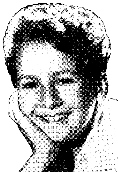
BOBBY BREEN, Hollywood's youngest singing star, will be heard from 2YA on Tuesday evening, November 14