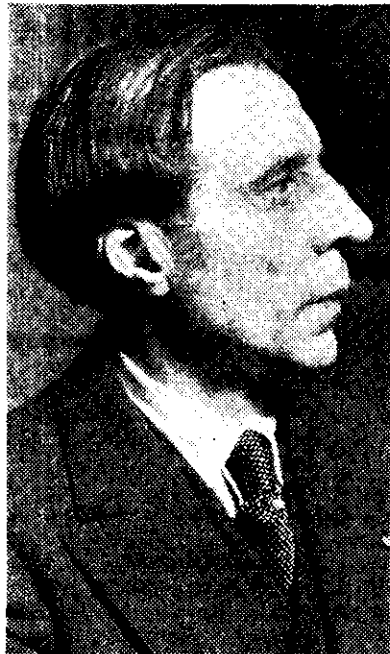
WITH Maggie Teyte (soprano), Alfred Cortot, the famous pianist (above), will be heard from IYA on Wednesday evening, November 15, in two arrangements of Debussy compositions

"String Quintet in E Flat Major" ..... Mozart Allegro di molto, Andante, Menuetto, Finale (Allegro)