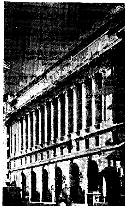
TO HOLD a thing of beauty in the mind's eye and translate it into "consummate palaces of metal or of masonry," such as the noble facade of Lloyds Bank in London (above), is simply a "job of work" to an architect. Listeners will hear how it is done from 2YA on October 26, at 8.40 p.m.