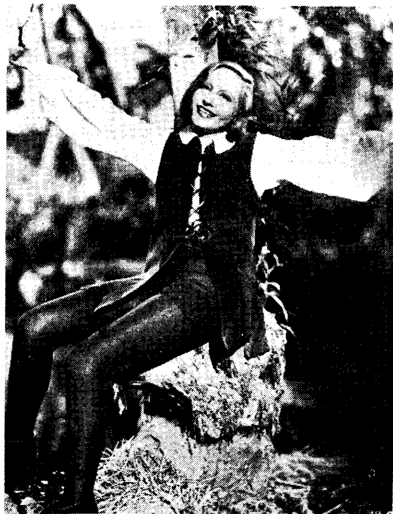
SHAKESPEARE claims his share of the limelight again this week, with an NBS production of "As You Like It," from 4YA, on Sunday evening, October 8. Listeners may remember seeing Elisabeth Bergner in the Gaumont-British film version. Here she is, all alone in the Forest of Arden