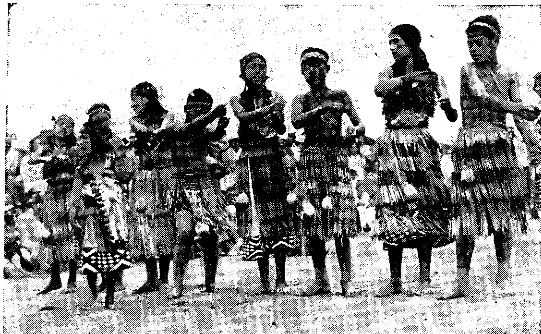
"DANCING DOWN THE AGES" is the title of a new feature, the first episode of which will be presented from 2YC on September 19 at 9.5 p.m. The series deals with the importance of dancing to all peoples in all ages, and the first episode covers from the early Egyptian to the early Maori dances. Here we see some young Waikato Maoris taking a poi dance seriously.