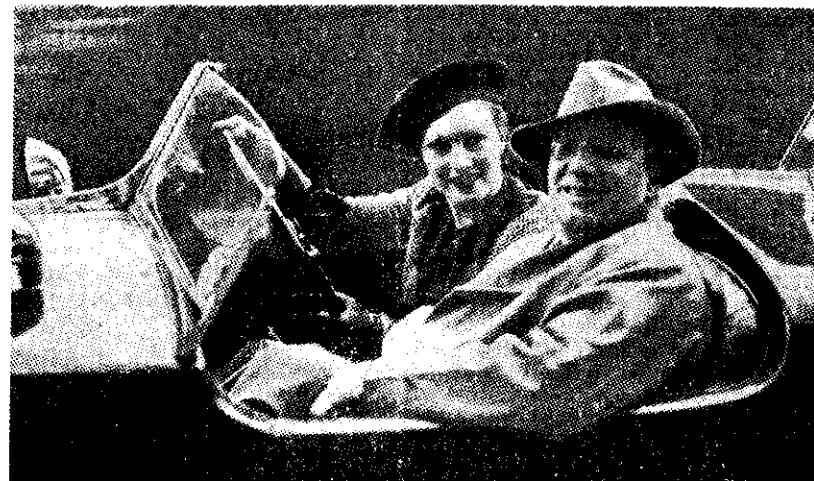
BBC, photograph RICHARD TAUBER, photographed recently with his charming wife, the British film-star, Diana Napier.