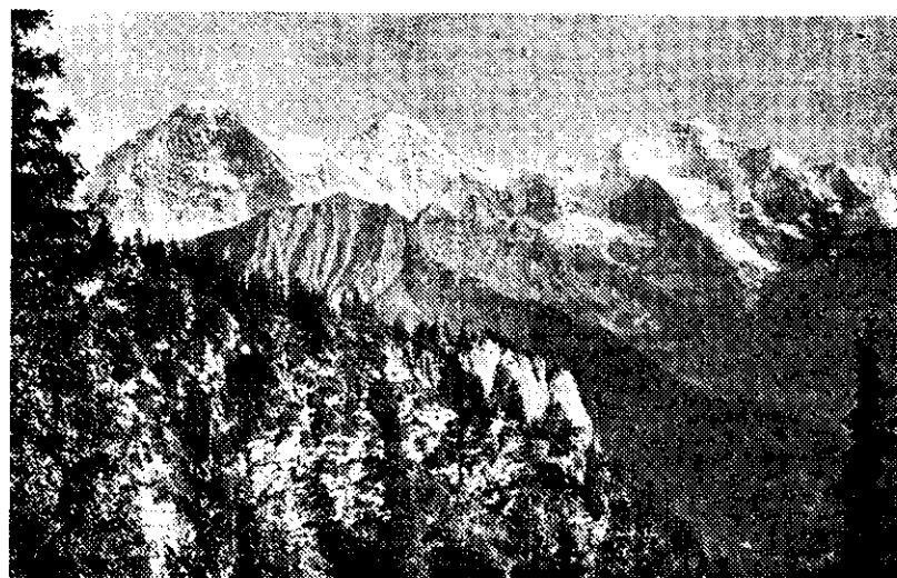
BEHIND THE BASTIONS of her mountains, Switzerland stands to arms. The little mountain republic is the week's "port of call" at 4YZ and 2YD on Tuesday, September 19. The peak on the right of the photograph is the Jungfrau