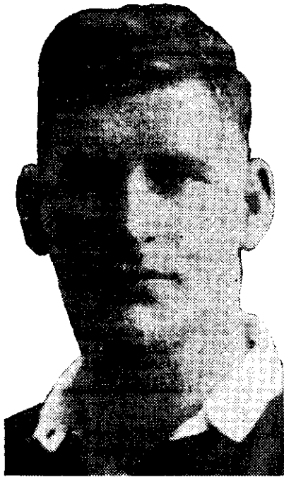
G. T. ALLEY, 1928 All Black , who speaks from 2YD on Wednesday evening, August 30, in the series "Is New Zealand Rugby Deteriorating?"