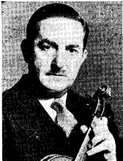
MAREK WEBER is a name familiar to all listeners who follow light operatic recordings. His orchestra will be heard from 3YA on Saturday, August 12