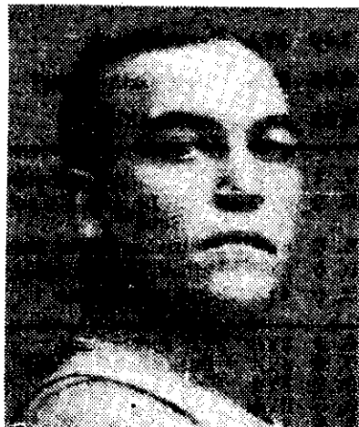
HEAVY-WEIGHT BOXERS of a bygone day were Bob Fitzsimmons (left) and Jim Jeffries (right). Their fight at San Francisco in 1902 is the "Scene from the Sporting Past," to be broadcast from 3ZR on Wednesday evening, August 9