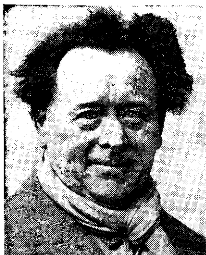
PROFESSOR WILLEM MENGELBERG , who conducts the Philharmonic Symphony Orchestra of New York in a concert programme from 4YO on Wednesday evening, July 26