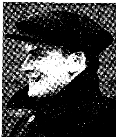
YEHUDI MENUHIN , whose maturity as a violinist bears out all the promise of his youth. He will contribute to the programme from 3YA on Wednesday evening, July 26