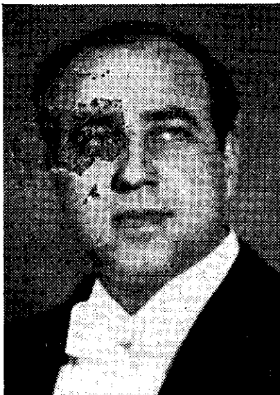
RICHARD CROOKS, tenor, who will be heard from 3YA on Friday evening, July 21