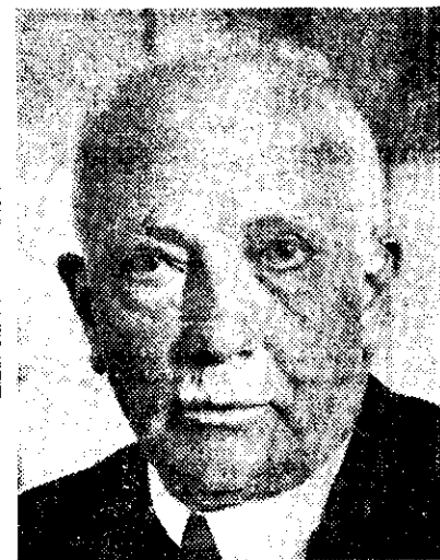
RICHARD STRAUSS, who wrote the music for "Der Rosenkavalier," which will be presented from 4YA on Sunday evening, July 16

Now in his seventy-fifth year, Richard Strauss has proved to be the most vital and successful of the successors of Wagner. He was born into a musical circle. His father was first horn player in the