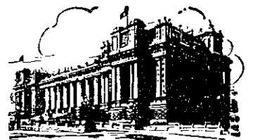
Photo of Federal Parliament House, Melbourne where "ASPRO" Tablets were declared a Necessary Commodity by the Australian Commonwealth Government.

MINIMUM PRICES 1/ 1/6 2/6 4/6 OBTAINABLE EVERYWHERE