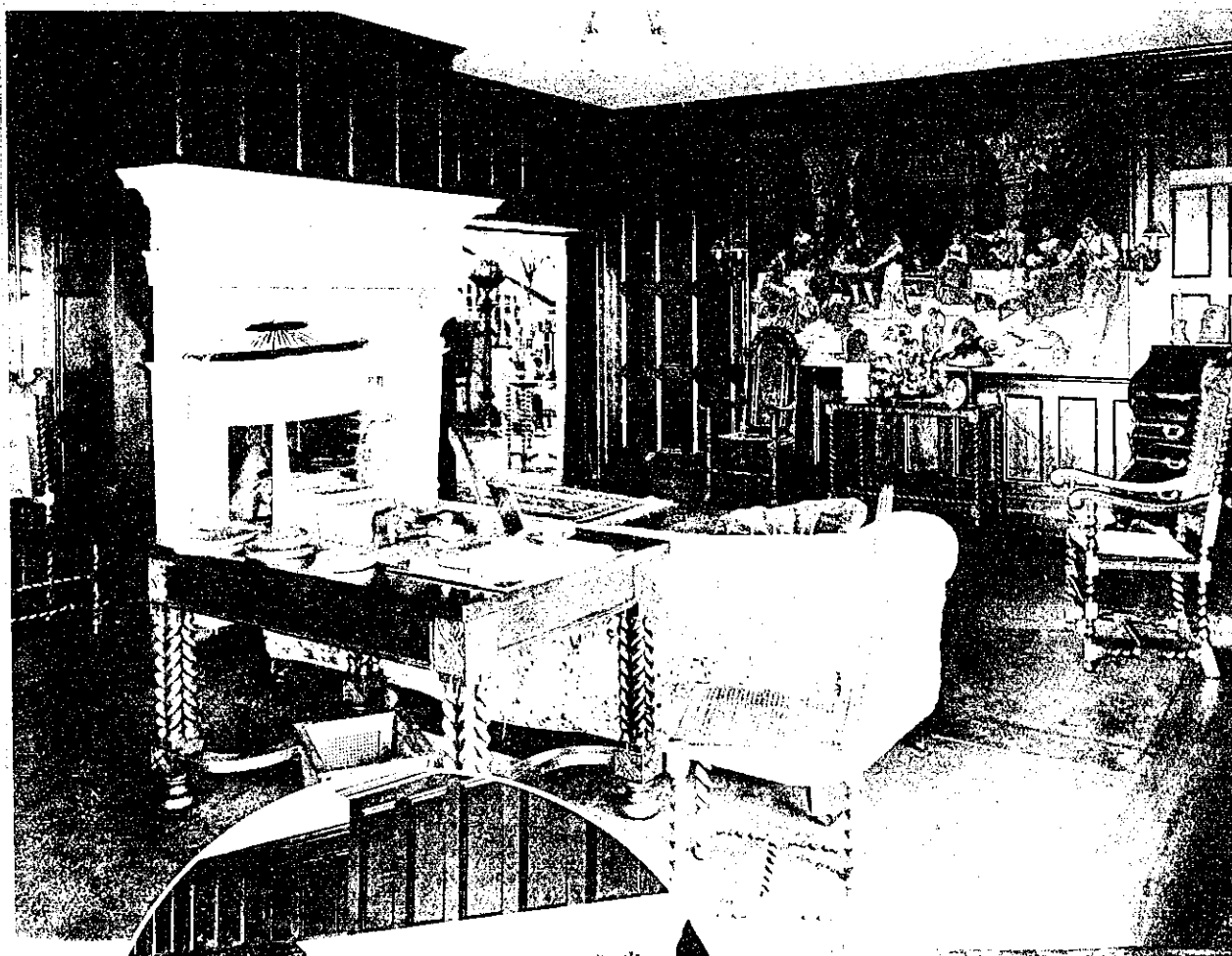
The L I V I N G R O O M Sufficiently dignified for the most im- portant gath- erings, the l i v i n g - room, with the mellow colouring of time - toned panelling en- hancing the beauty of

the mantel, and the rich shades of the tapestry, makes an ideal room in which to live and work.