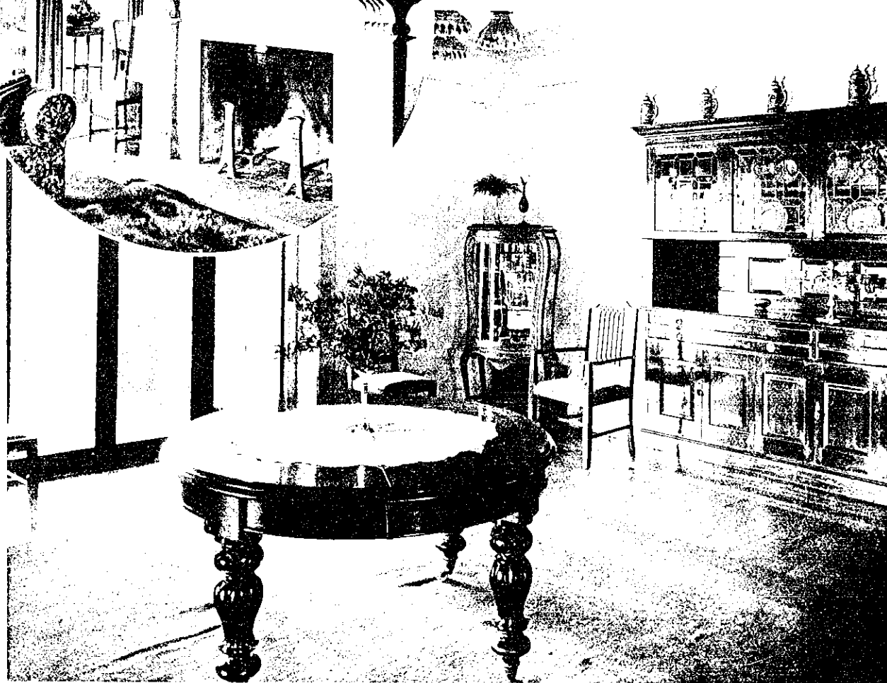
The D I N I N G - R O O M where wide glass doors open on to the garden, allowing sunlight to be a constant guest. The dark furniture contrasts delightfully with the light walls and the old china.

Beautifully carved is the mantelpiece in the living room, a tra- dition handed down from Renaissance times through the brothers Adams.