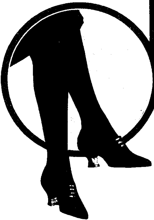
Above. —The simple Court Styles always find favour: and more so the smart model in Black Suede here shown, which has an effective insertion tab at front, and Baby Louis Heels. This very neat footwear is from a reliable American maker. The Hosiery shown is of fine Drop Stitch in Heavy Milanese Silk, showing in Black, White, Grey, Nigger, and Beige.