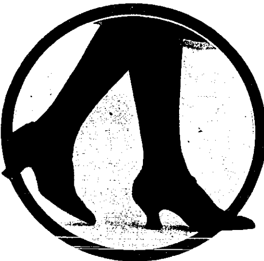
At Left. —A very trim One-strap Shoe in Black Satin, with Beaded Front and Full Louis XV Heel. The striking Hose in Black Milanese with openwork self stripe are beautiful in lustre and quality.