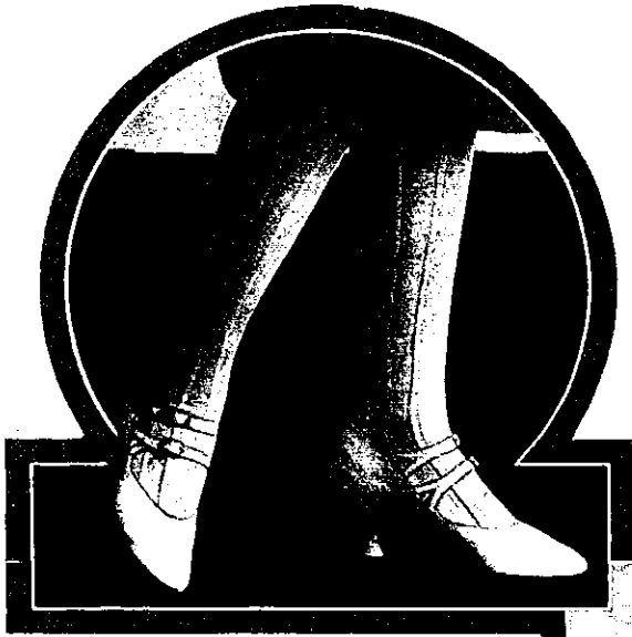
Above. —Smartness and comfort are assured in these smart Summer Shoes in White Kid, featuring the Fancy Grecian Sandal Strap effect. The Hose, in rich White Silk, with triple-weave self stripe, are of fine quality and exquisite lustre.