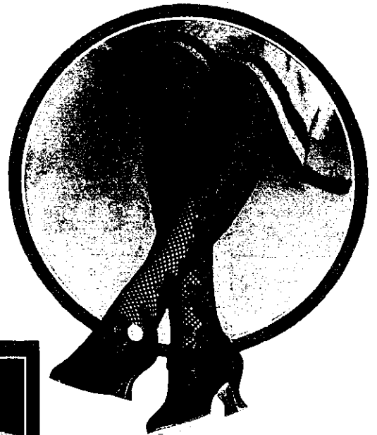
Above. —Newly arrived American Model Shoes in Black Satin. The single strap fastens with button and effective cluster of Brilliants. And one could scarcely wish for more beautiful Hose for afternoon or evening wear than the newest example in Milanese Silk also shown here.