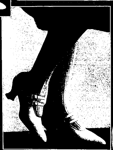
Above. —These very shapely Two-strap Shoes in White Kid are from Selby's—sufficient guarantee of excellence. They are shown worn with Pure Silk Hose of new graduated Drop Stitch design.