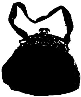
The exquisite deep-brown silk velvet shaping this bag is gathered softly together under the petals of the pine cone which forms its clasp. It is beautifully lined with old gold brocade flecked with deep blue. £8/6/6

T HE trend of fashion in handbags for present wear shows a distinct inclination towards the finer leather and suede bags. . . . Navy blue and black moroccos with white facings are very much in vogue. . . . Beaded bags are not in favour though silk and velvet in dainty pattern and exclusive design are quite as popular as ever. . . . The Handbags here illustrated, selected from Whitcombe's exclusive stock, are correct in every way and representative of prevailing modes. . . . The woman of fashion will find at Whitcombe's the desired handbag to match her new frock.