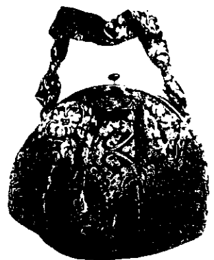
An exclusive bag in heavy black and burnished gold satin brocade, designed in the mode of the day, lined with delicate apricot taffeta and clasped with tortoiseshell. 47/6