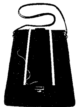
A distinctive and pleasing design in navy blue morocco faced with the fashionable white stripe. The inside is lined with heavy navy blue moire, whilst the clasp is of silver. 80/-

The above are only a brief selection from our extensive stocks, we cordially invite your inspection, in doing so you are under no obligation to buy