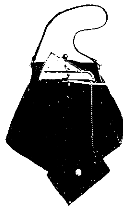
Beautifully soft Pama suede of pleasing brown makes this a most attractive and serviceable bag, lined with watered silk and fitted with dainty purse, mirror and powder puff. 52/6