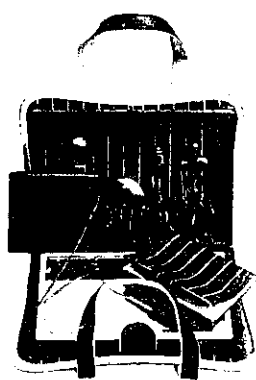
An appealing purse vanity case of black morocco with white facings. It is daintily lined with striped silk and contains every necessary fitting. 60/-