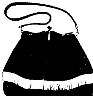
A fine-grained black morocco handbag. The white dashed fringe strikes a pleasing note of distinction. Daintily lined with silk, patterned with a white stripe on black ground. A purse and mirror are fitted. 87/6