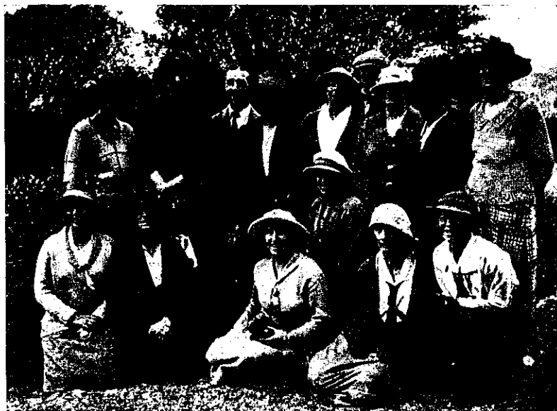
At the New Zealand Championship Meeting at Heretaunga.