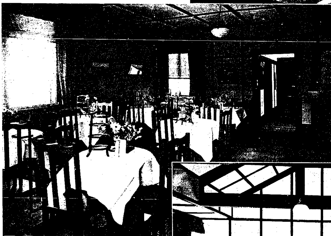
The bright and airy lunch-room, with its purple curtains and frieze, is very inviting. Quite a large supper party can be seated here with ease.