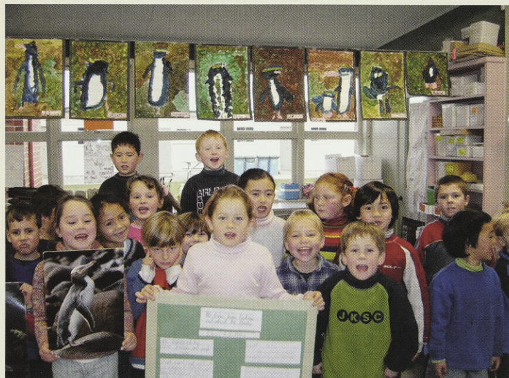
Penguin conservation programme: children from Room 7 Waverley Park School show their yellow-eyed penguin posters. The children also raised funds for Southland Forest and Bird's Te Rere penguin reserve by making popcorn.