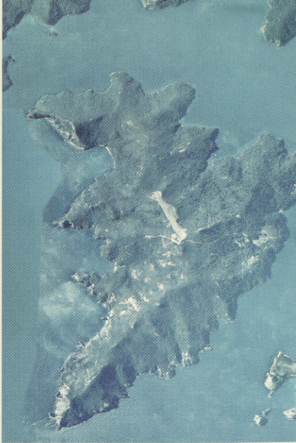
Kaikoura Island lies in the entrance to Port Fitzroy on the northeast coast of Great Barrier Island, in the Hauraki Gulf. The island has been purchased in a joint-venture deal led by the Government and is to be used for environmental education and conservation.

they will contribute, the Government has underwritten the difference. After two months, only Auckland City had made a commitment — of $83,000.