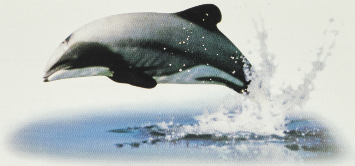
(Hector's Dolphin. Endangered species "Cephalorynchus hectori")