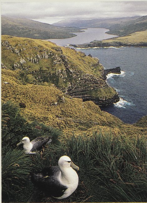
White-capped mollymawk colony, South West Cape, Auckland Island, looking towards Carnley Harbour and Adams Island.

World Heritage "natural properties" must fulfil four criteria. These are: